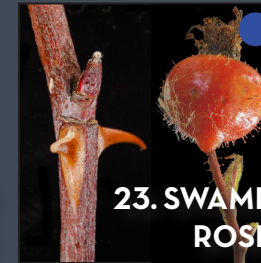
23. SWAMP ROSE