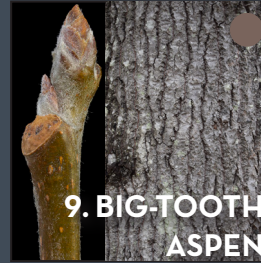
9. BIG-TOOTH ASPEN