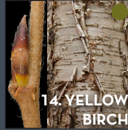
14. YELLOW BIRCH