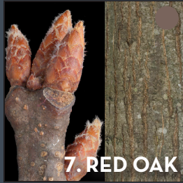
7. RED OAK