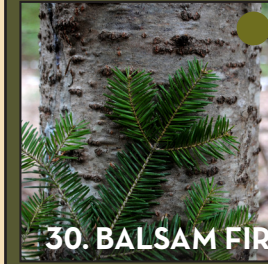
30. BALSAM FIR