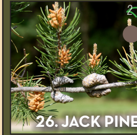
26. JACK PINE