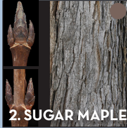
2. SUGAR MAPLE