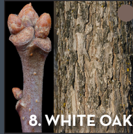
8. WHITE OAK