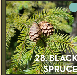
28. BLACK SPRUCE