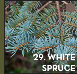
29. WHITE SPRUCE