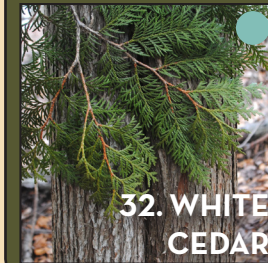
32. WHITE CEDAR