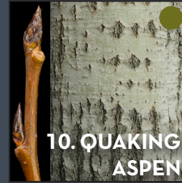
10. QUAKING ASPEN