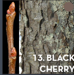
13. BLACK CHERRY