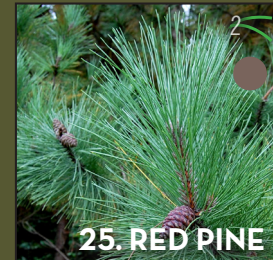
25. RED PINE