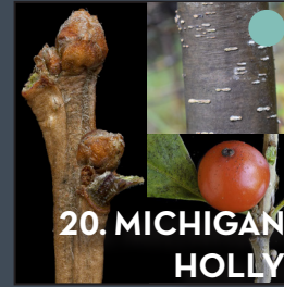
20. MICHIGAN HOLLY