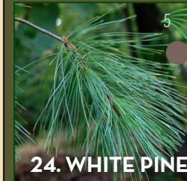
24. WHITE PINE