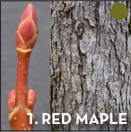
1. RED MAPLE