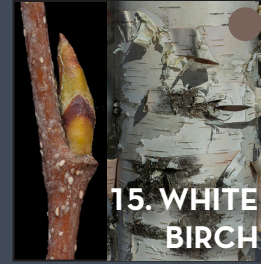
15. WHITE BIRCH