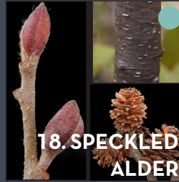
18. SPECKLED ALDER