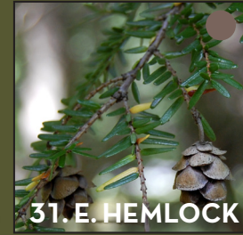
31. E. HEMLOCK