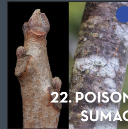
22. POISON SUMAC