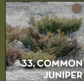
33. COMMON JUNIPER